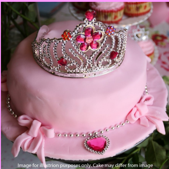
Image for illustration purposes only. Cake may differ from image

Join us at the Lynton Place Pamper Me Spa Party! Often times, spa days are planned for little girls. But even grown girls need a little pampering. So, we are providing you with an opportunity to take care of yourself.