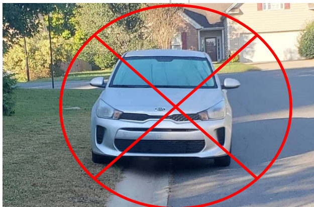
No parking on the street or lawns

No campers, trucks, vans or recreational vehicles may be parked or kept within the properties except within garages. No trailers, boats, or tractors may