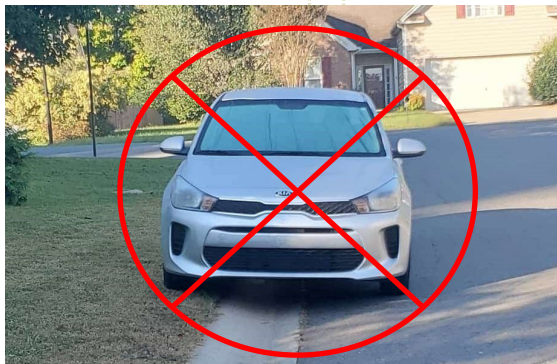
No parking on the street or lawns

Each unit has a one-car garage and driveway with a minimum of two (2) parking spaces. The Board of Directors has given the management company authority to tow, at the owner's expense, cars or other vehicles improperly parked. Spaces are reserved for the parking of automobiles or passenger trucks only. No campers, trucks, vans or recreational vehicles may be parked or kept within the properties except within garages. No trailers, boats, or tractors may be parked or kept within the properties except within enclosed garages. The following vehicles may not be parked overnight in Becton Park and are permitted only for the conduct of business (e.g., home re-